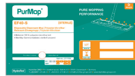
Bag label PurMop® EF40-S