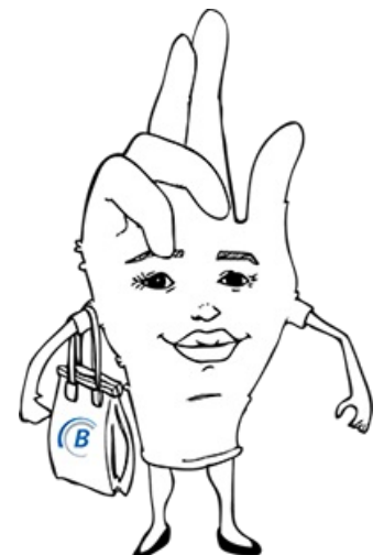
Ms. G. Love© represents BioClean's range of cleanroom gloves